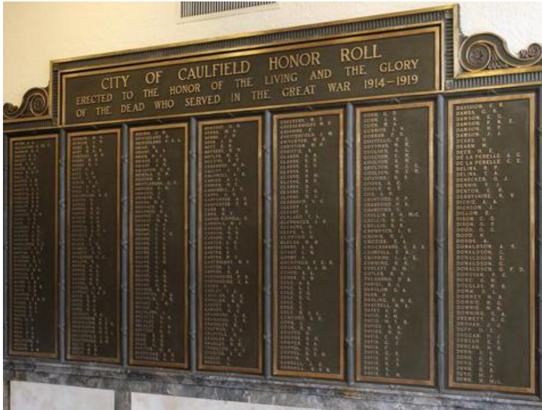
City of Caulfield Honor Roll