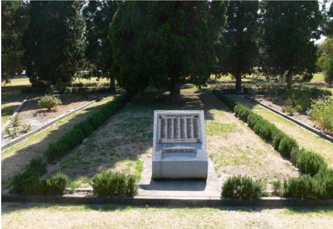
Caulfield Memorial Stone