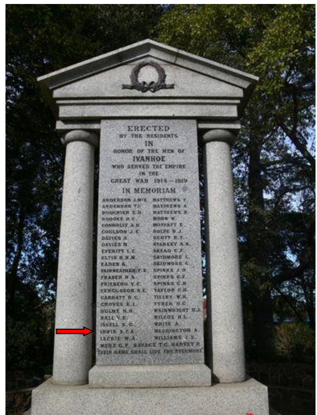
Ivanhoe War Memorial