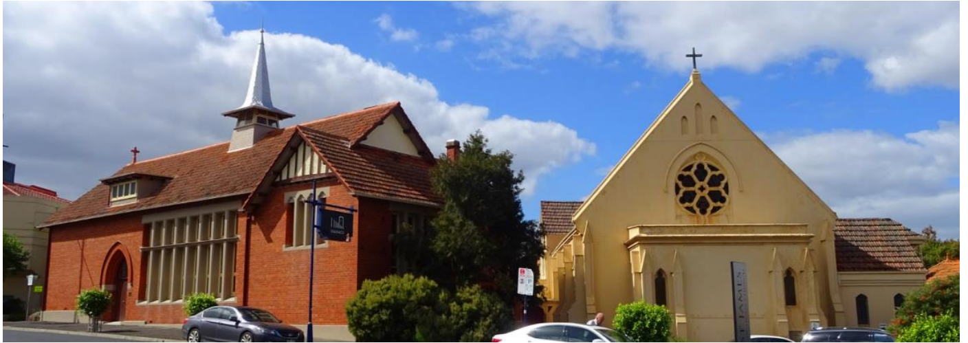
St. James Anglican Church, Ivanhoe