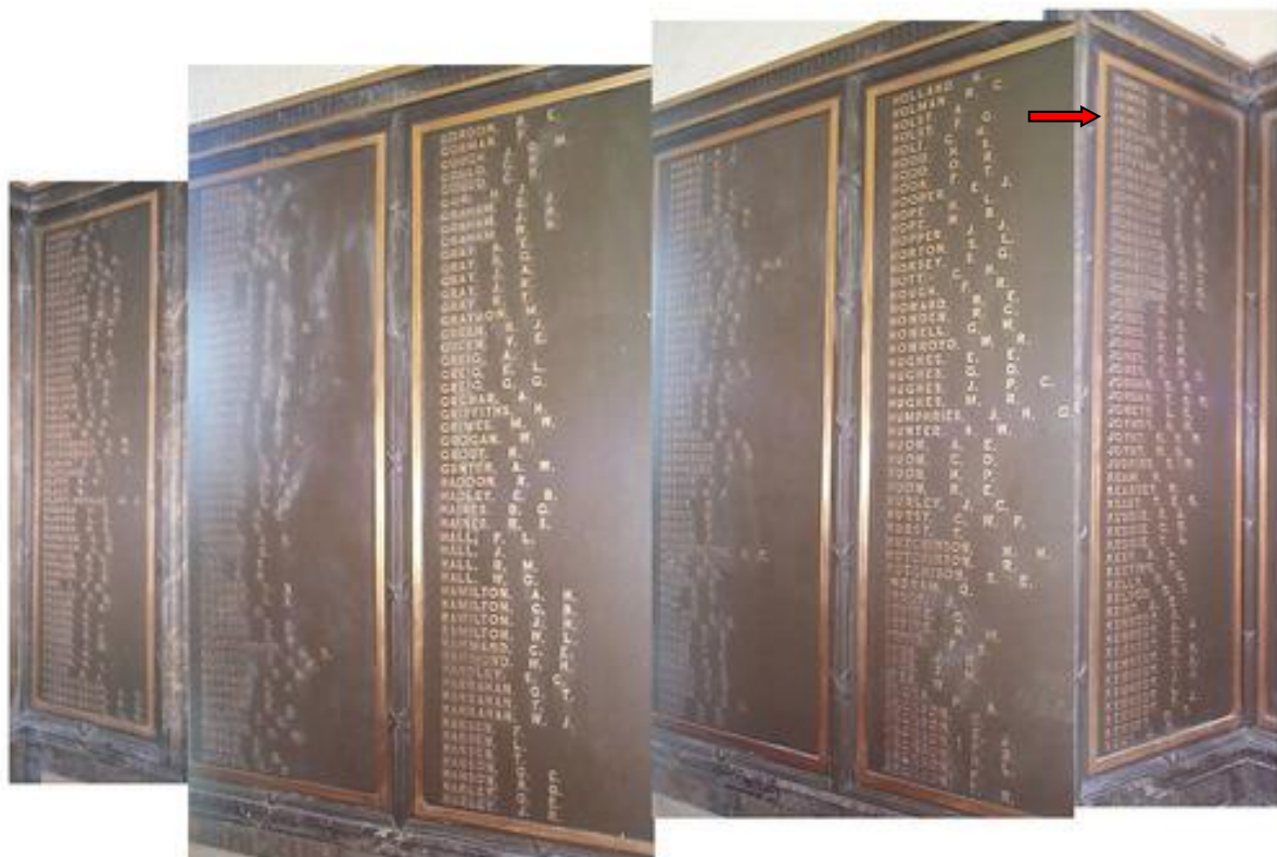
North wall, composite of 4 pics.