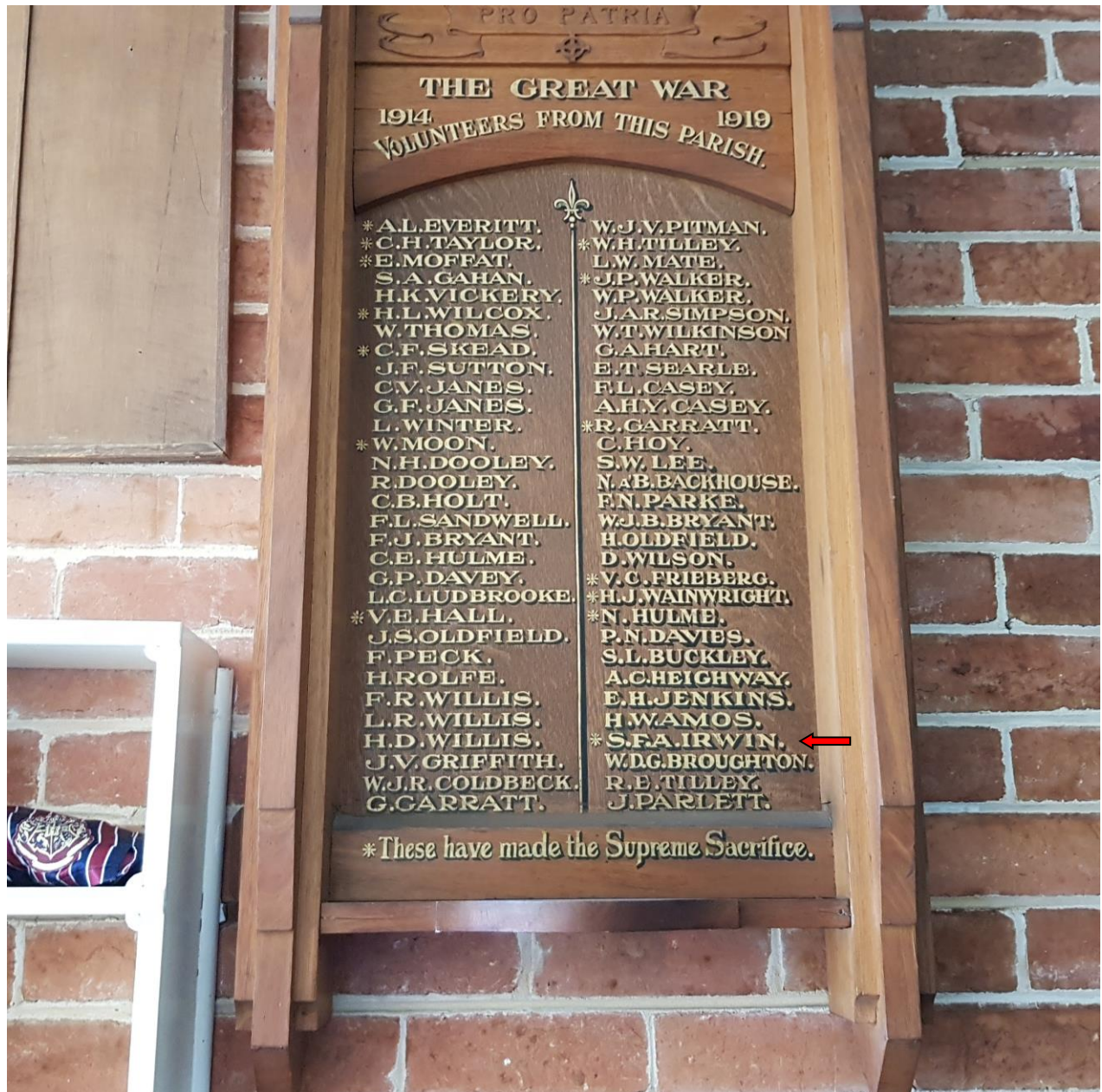
St. James Anglican Church Roll of Honour