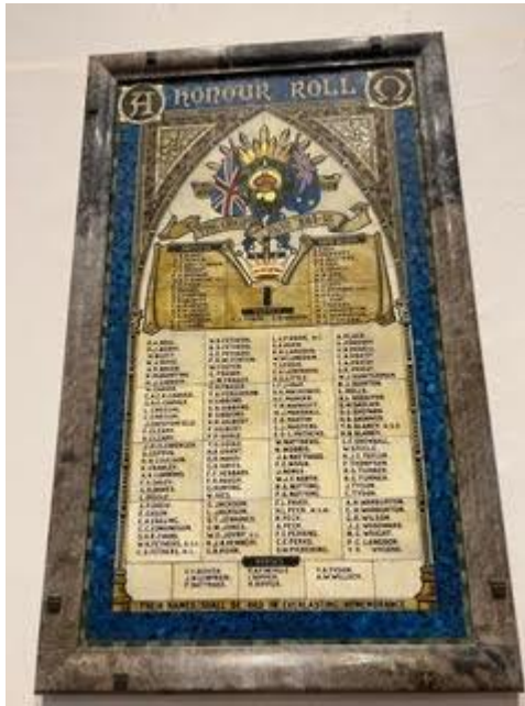
Caulfield Anglican Church Roll of Honour